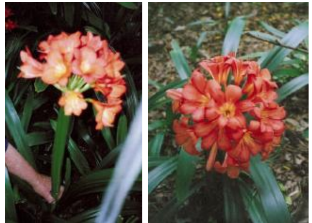
Dagny Oxford Original and Seedling

Note: Clivia Society is the South African Organisation of whom we are affiliated to, but a separate membership is required to receive the Year Book and four information packed newsletters a year. At $NZ36 pa it is well worth this cost for the extra exciting articles that appear.