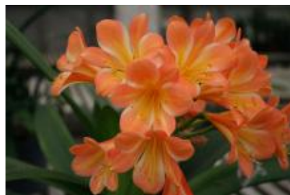
Diane x Yellow Tiger – Ian Duncalf