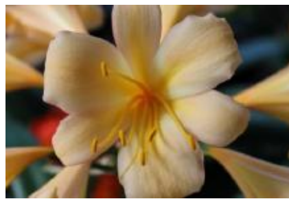
Chubb Peach Strain - Diana Holt