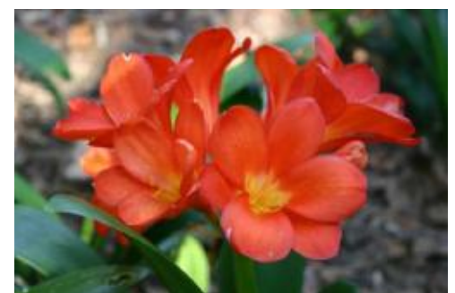
Kevin Walters Red-Orange