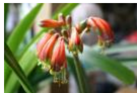
Bronze C gardenii