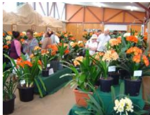
Toowoomba Show Display