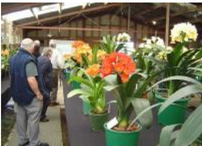
Photogenic Blooms, but camera-shy people.