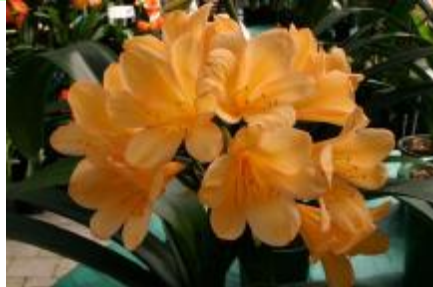
Visitors' Choice - Apricot Delight (Alick McLeman)