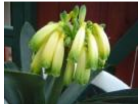
Yellow C. caulescens First flowering in NZ