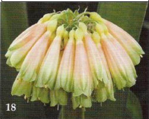
Clivia nobilis from Olifantskop, the most westerly recorded population, 800km from Oorlogskloof. Grower: Michael Jeans

As mentioned earlier the seed of C. mirabilis is ready for sowing in March. Two methods of sowing were used. One method was to remove the seed from the berry and wash in water that had a liquid soap added. This acts as a fungicide and also helps to remove the membrane that covers the seed. Finally the seed was washed in clean water and placed in a clean transparent plastic bag, sealed and kept in a warm place. Germination occurred in three to four weeks. As the seeds germinated they were removed from the plastic bag and planted in 15cm pots containing a medium similar to that used for the larger plants. The other method of sowing the seed is the conventional way of placing cleaned seed in the growing medium at a depth of one and a half times the size of the seed and keeping it moist. The root develops first followed by a narrow leaf. This method turned out to be just as effective as using the sealed plastic bag.