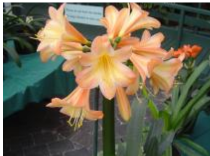
Ian Duncalf Interspecific