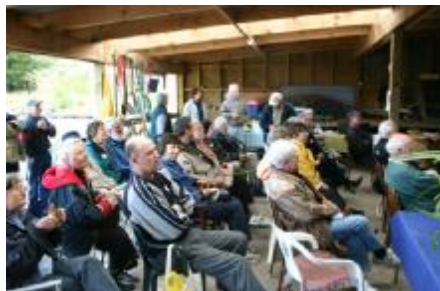
AGM – Audience obviously impressed by the work of their excellent committee.